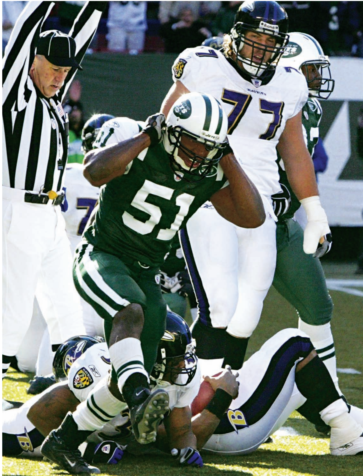
Vilma's leadership on defense helped turn the Jets from a losing team to a playoff contender.